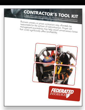
Contractors' Tool Kit