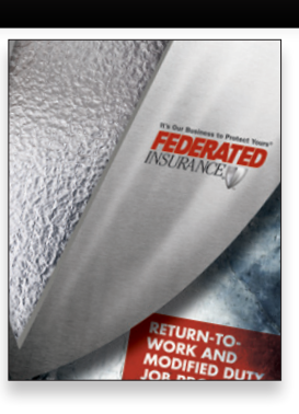
Return-to-Work and Modified Duty Programs