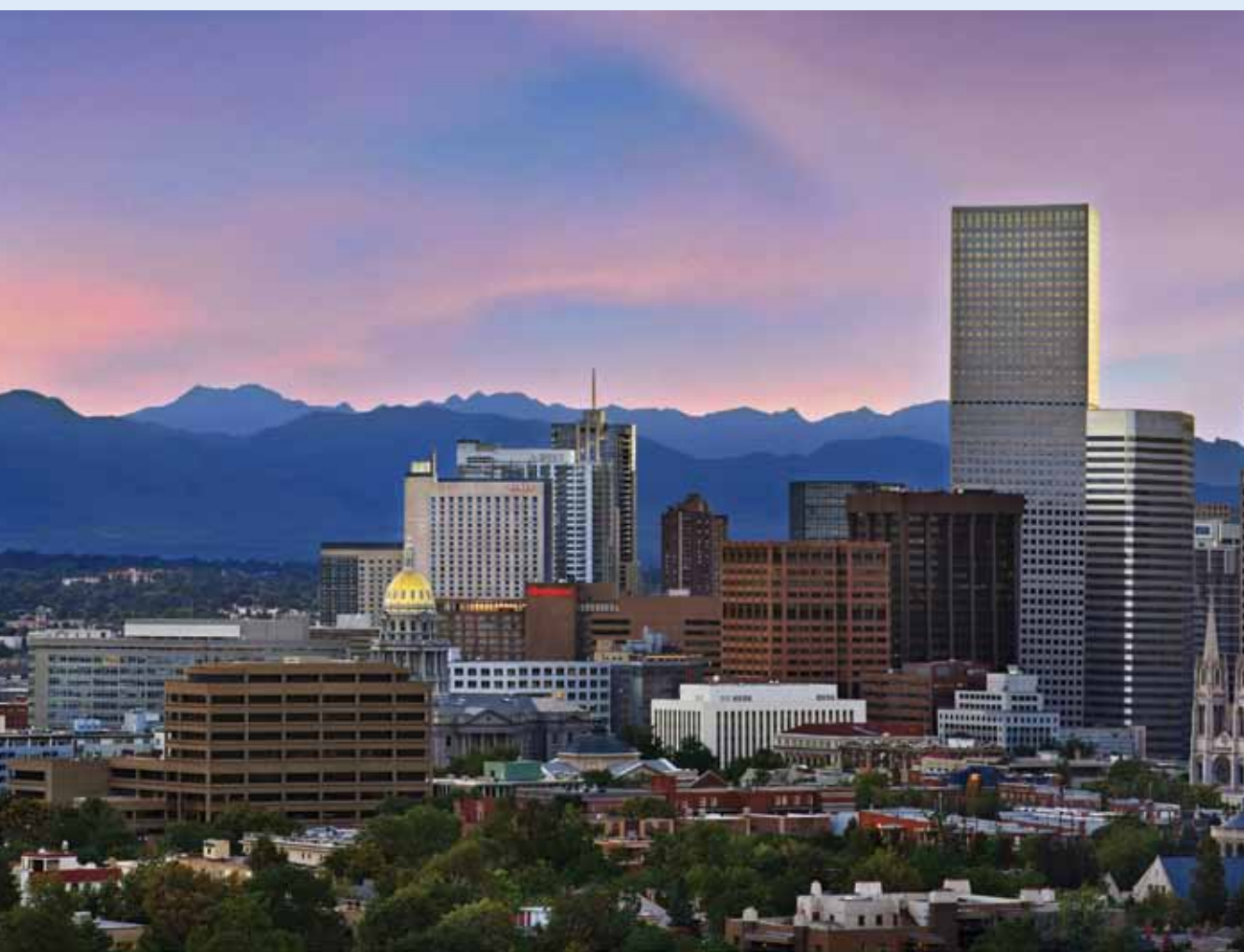
DENVER SKYLINE AT SUNSET