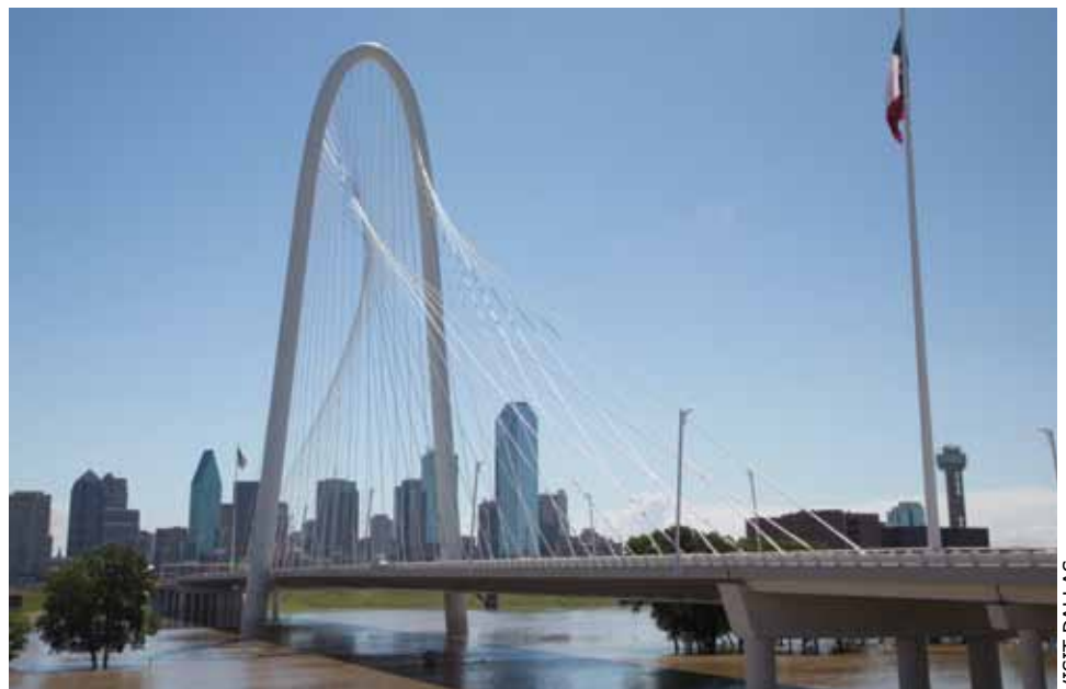
Margaret Hunt Hill Bridge