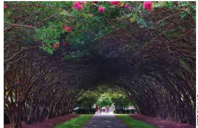
Dallas Arboretum and Botanical Gardens

If you appreciate nature, you'll love these 66 acres of gardens nestled on the shore of White Rock Lake, approximately 20 minutes from the hotel by car. The gates are open 9 am to 5 pm every day, with after-hours access on Wednesday evenings.