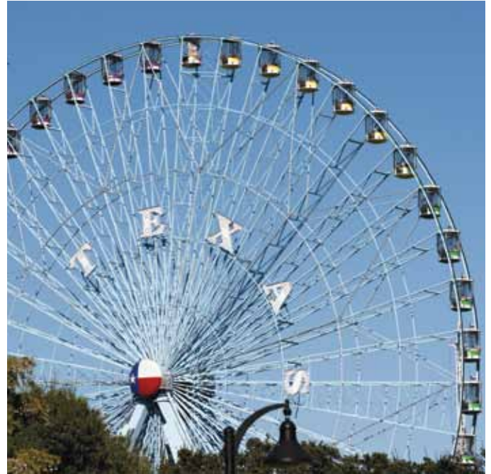
State Fair of Texas Ferris Wheel